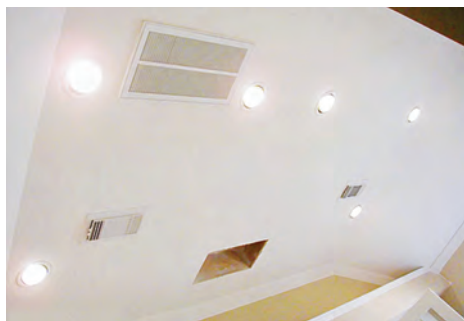
Incandescent light fixtures in the ceiling below the attic can often generate enough heat to melt snow on a roof.

Prevention remains the most effective strategy for stopping ice dams. Homeowners can take several steps to prevent heat from escaping your attic or the interior of your house.