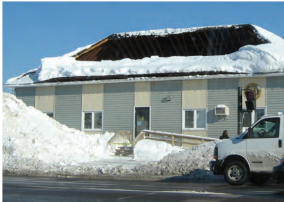
Roof collapse can be a stressful and expensive experience for homeowners..

But even with a sloped roof, snow and ice can still build up on flatter areas of the roof. Obstructions, such as chimneys, skylights or dormers, are particularly susceptible to snow build-up.