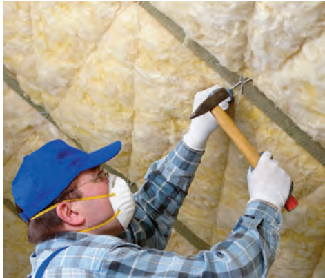
Fibre glass insulation can significantly reduce heat loss from your home.

Increasing the insulation above your ceilings can help prevent heat from escaping into your attic or through your roof. For suspended ceilings, fibre glass batt insulation can be installed to prevent heat loss. For drywall ceilings that are nailed directly to the joists, blown insulation in addition to fibre glass insulation can be effective.