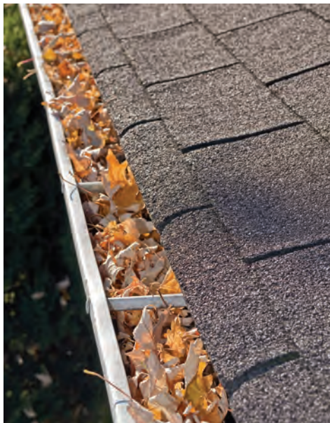
Blocked gutters can stop water from draining from your roof and cause ice dams.

For some homes, especially those with aging drainage systems that are surrounded by trees, this type of preventative maintenance may still not stop ice dams. In this case, a heating cable installed on the gutter or downspout may be necessary.