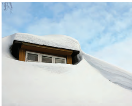
Snow can collect behind roof obstructions, such as the ones pictured above. These include vents, chimneys or gables

In the aftermath of significant snow or ice event, there are several important indicators a homeowner can use to determine if a sloped roof is under structural stress from snow or ice. The Canadian Mortgage and Housing Corporation (CMHC) recommends that homeowners check for 1 :