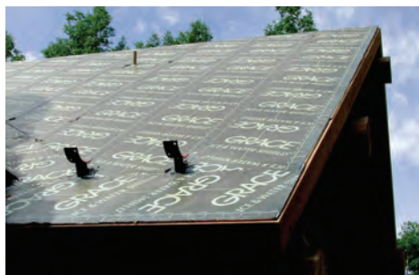
Snow and ice shield.

Re-roofing also offers another opportunity to prevent ice dams. During installation homeowners can install a secondary moisture or snow and ice barrier to prevent heat loss. To make sure the barrier is effective homeowners should consider using two layers of underlayment that are cemented together.